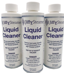
JIFFY STEAMER LIQUID CLEANER