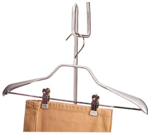
PROFESSIONAL GARMENT HANGER