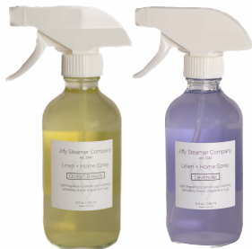
JIFFY STEAM SPRAY