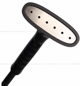
Optional 6" wide stainless steel head & plastic handle (J-2S)

Two Color Options Available: GRAY or PINK