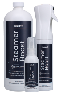
JIFFY STEAMER BOOST