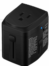
ESTEAM Travel Converter with Adapter Plugs

Two Color Options Available: WHITE or BLACK