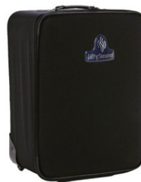
JIFFY TRAVEL CASE

More accessories available at jiffysteamer.com