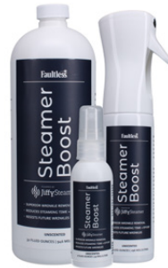
JIFFY STEAMER BOOST